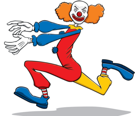
Clown sightings led to a police response in Sloan. Three clowns were jumping in front of and chasing cars on Reiman Street.