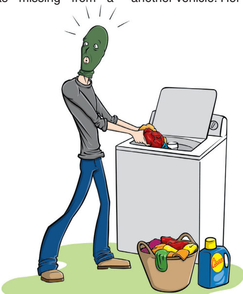
A Shepard Avenue resident reported that someone broke into her house to do laundry.

• A caller said items found in a suitcase behind a Genesee Street hotel could be drug paraphernalia “or foreign food.”