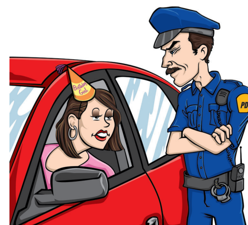
A West Seneca woman charged with DWI told the Orchard Park police officer, “You can’t arrest me. It’s my birthday.”

school vehicle hit a parked car on Maryvale Drive.