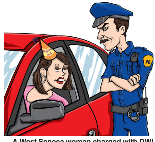
A West Seneca woman charged with DWI told the Orchard Park police officer, "You can't arrest me. It's my birthday."

school vehicle hit a parked car on Maryvale Drive.